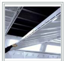
Hinged ceiling filter frames for easy replacement of 10 micron media filters.

AQMD Compliant Low Nox Burners Required in California at an additional cost. Freight and Installation not included.