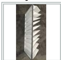
Paint-stop filter trays for balanced, pre-engineered air flow.