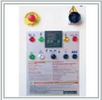
Electromechanical control panel.