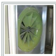
Pre- and Post-filtration: Intake and Exhaust. Two direct drive centrifugal fans with 2 sets of 10 bag filtration for each.

AQMD Compliant Low Nox Burners Required in California at an additional cost. Freight and Installation not included.