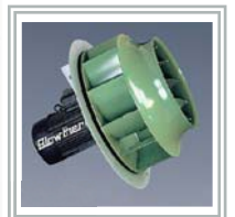
Direct drive centrifugal fans.