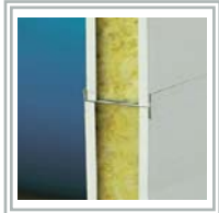
Dual skin wall panels joined by H channels with rock-wool insulation.