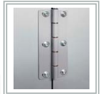
Heavy duty adjustable steel hinges allow doors to open to optimum position.

*Price Includes: World 8000 Booth Solid Back Single Row Pit 10 HP Direct Drive Fans Electromechanical Control Panel Ductwork Packages (15' Roof Height)