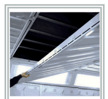
Hinged ceiling filter frames for easy replacement of 10 micron media filters.