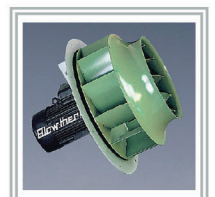
Twin 10HP direct drive centrifugal fans.