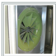
Pre- and Post-filtration: Intake and Exhaust. Two direct drive centrifugal fans with 2 sets of 10 bag filtration for each.