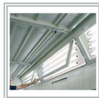
Eight 4-Tube LED light fixtures with hinged access for ease of cleaning and maintenance.

2 Row Pit Solid Back Four 4-Tube LED Wall Lights Intake/Exhaust Turbo Fans w/VFD's Ductwork Package (15' Roof Height)