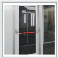
Internal push bar on the front door and the side personnel door.