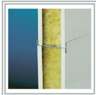
Dual skin wall panels joined by H channels with rock-wool insulation.