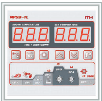
New SBC P1 Control Panel