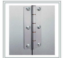
Heavy duty adjustable steel hinges with brass bushings open door to optimum position.