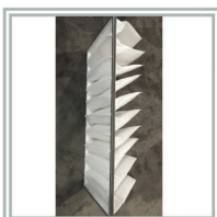
Paint-stop filter trays for balanced, pre-engineered air flow.