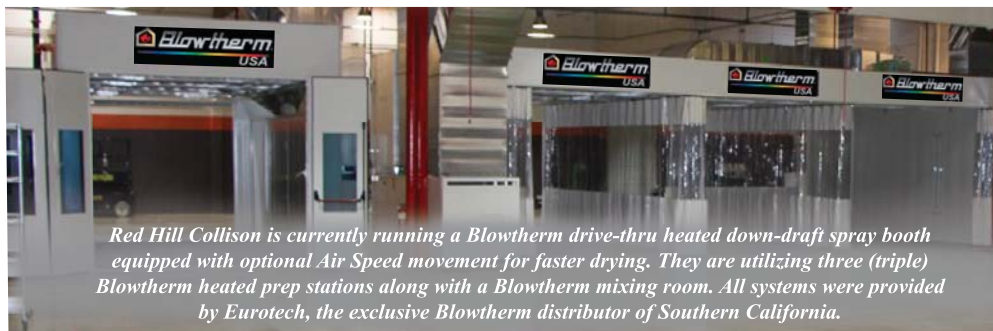
Red Hill Collision is located at 350 McCormick Avenue, Costa Mesa, CA. “...We plan on opening multiple locations throughout the Southern CA area ... all utilizing Blowtherm USA prep stations, spray booths and mixing rooms.” ~ Armando Nogueiras, CEO